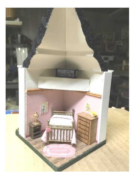
Alabama Fun Day 2015 prototype

The Mobile Miniature Club will be hosting an Alabama Fun Day on Saturday, September 19, 2015, in beautiful Gulf Shores, Alabama. The project will be a quarter scale bedroom made in a piece of full size crown molding. A photo of an early prototype is below. More information will be forthcoming, so mark your calendar and plan to attend!