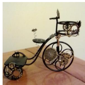
Charlotte club's May project, a steampunk tricycle plant stand