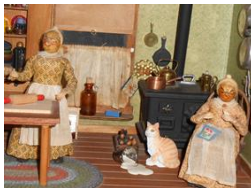
The Hickory People