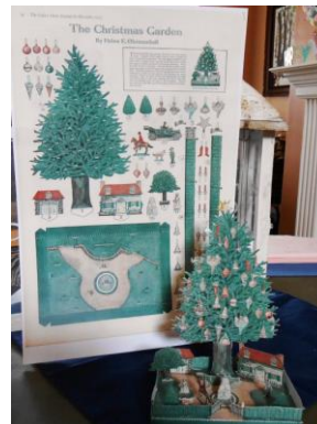
Ladies Home Journal Dec. 1917